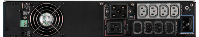
5PX from 1500VA to 3000VA.